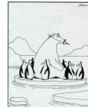
"And now Edgar's gone... Something's going on around here."